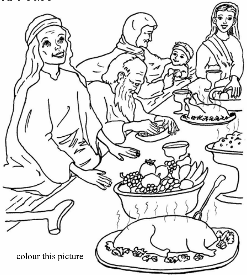
colour this picture