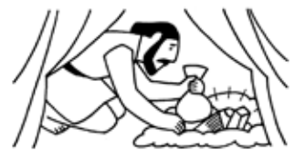
from The Complete Bible Story Clip Art Book.