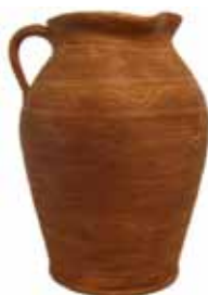
Gospel / Word of God