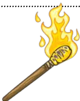
Dependence upon God