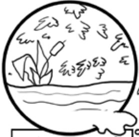
WATER TURNS TO BLOOD