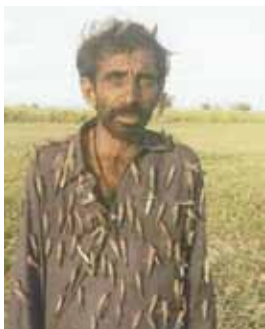
A Pakistani Christian farmer covered in locusts

Wow! There wasn't much left after all that! Imagine living through all those plagues. We may be able to begin to understand how they felt even better at the moment. We may all be worried and fearful of the virus that is going round. Also in Africa and Asia some countries are experiencing a terrible plague of locusts, just like the eighth Plague.