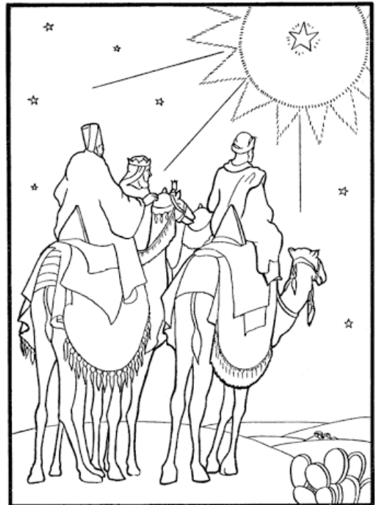
The Wise Men Followed the Star