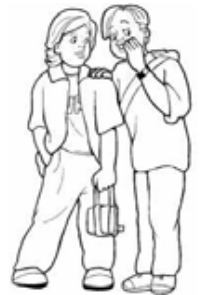
Tales about others

Jesus healed many deaf people. When we become Christians we hear God's call and o _ _ _ our Saviour.