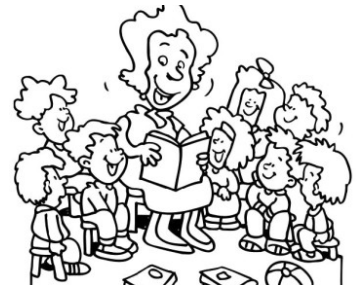
Sunday School lessons

When Peter knocked on the door, Rhoda heard and answered. Draw a picture.