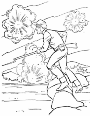
War and gunfire