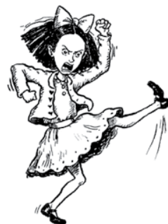
Stamping feet in anger

Jesus healed many lame people. When we become Christians we want others to hear the Gospel of peace with God – the Bible says those who carry this message have b _ _ _ _ _ feet.