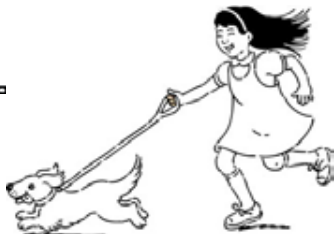
Walking the dog