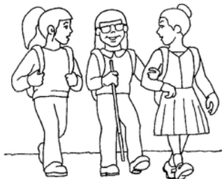
Guiding a blind person