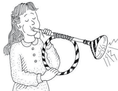
Playing the trumpet

Jesus healed many dumb people. When we become Christians we want to sing the praise of our Saviour.