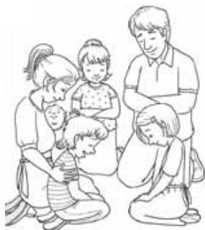
Praying to the Lord