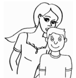
Kissing those we love